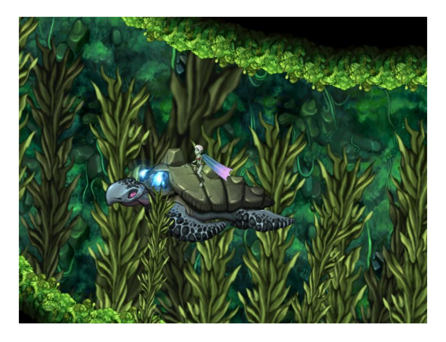
Buffy Stole Your Sandwich Ativador Download [full Version]

Download >>> <a href="http://bit.ly/2JYrsN1">http://bit.ly/2JYrsN1</a>